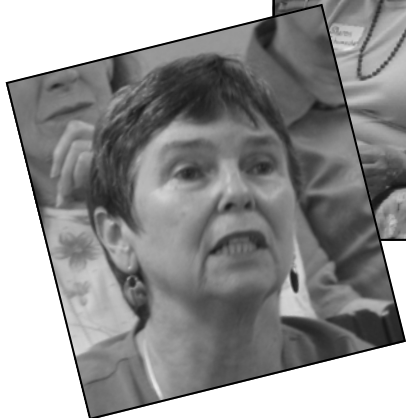
Members engaged in a lively discussion of ALRI's present and future plans