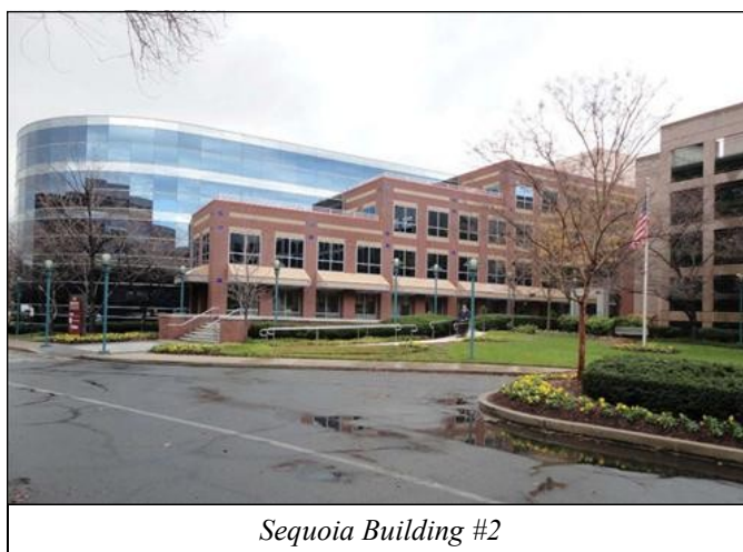
Sequoia Building #2

tion of shared support. Transparency of function and clear signage should ease navigation within the new space. Obvious separation between the public and private areas of the new education center—classrooms, in-