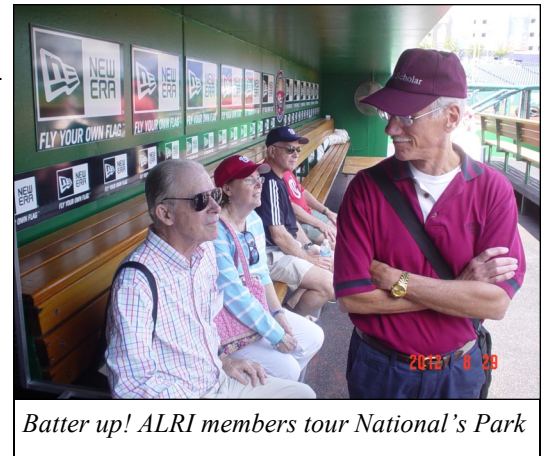
Batter up! ALRI members tour National's Park

Wednesday, January 23, 2013 – United States Institute of Peace . United States Institute of Peace. Registration required. This event is free; limited to 25 members.