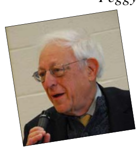
More pictures from Course Preview on page 10.