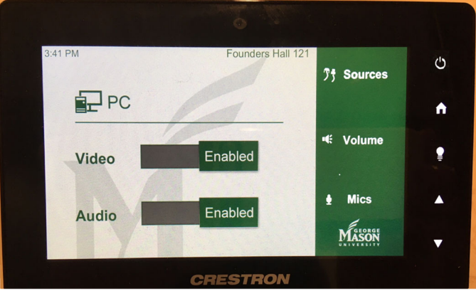
ABOVE IS THE CRESTRON TOUCH-SCREEN PANEL. THE DEFAULT SOURCE SETTING IS PC BUT YOU MAY