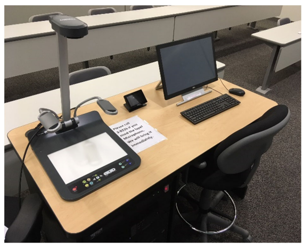
INSTRUCTOR'S TABLE WITH DOC CAM, CRESTRON CONTROL PANEL AND PC MONITOR AND DOC CAM